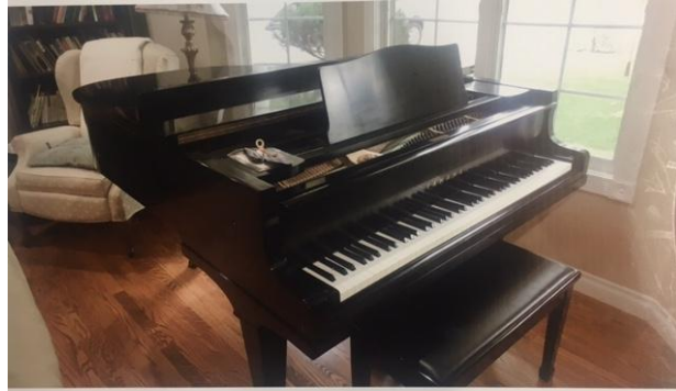
Yamaha G2 #386496 (1966) In Good Condition. A nice piano for student, church, practice.