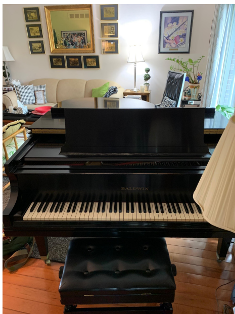
1977 Baldwin Model R Baby Grand Perfectly maintained, has a beautiful tone! $6,000