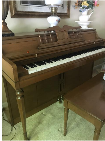
Early 1970s Wurlitzer Spinet Needs a tuning FREE!